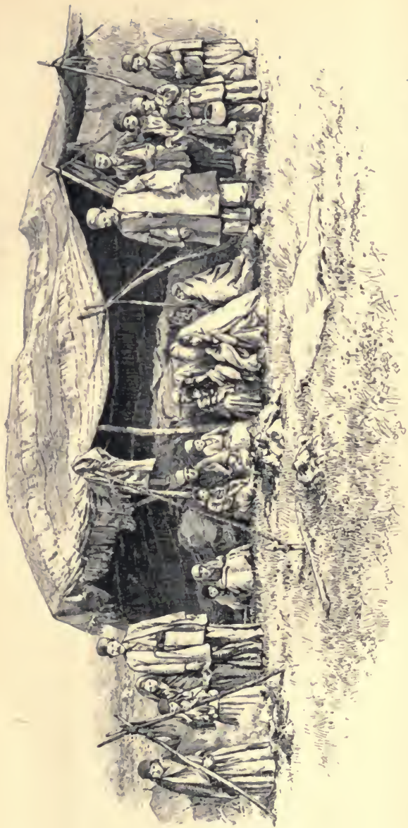
A DASTGIRD TENT.